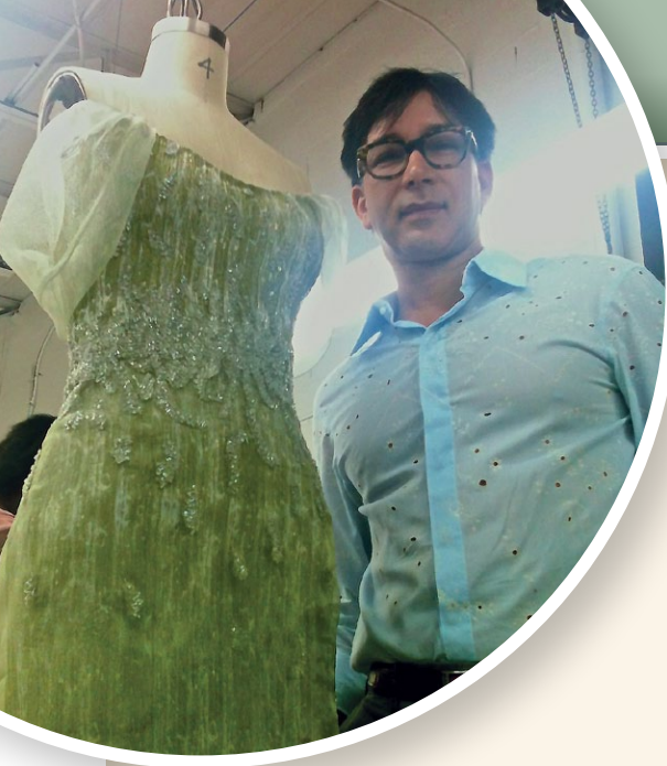
✦ LEFT TO RIGHT: Burberry bomber jacket with fur collar; Matthew Williamson's '70s-inspired psychedelic minidress; Rachel Zoe's black and white mini with thigh-high tights; Versace Collection does color blocking; Missoni animal-print everything, including bolero jacket. INSET: Cape top by Totême.